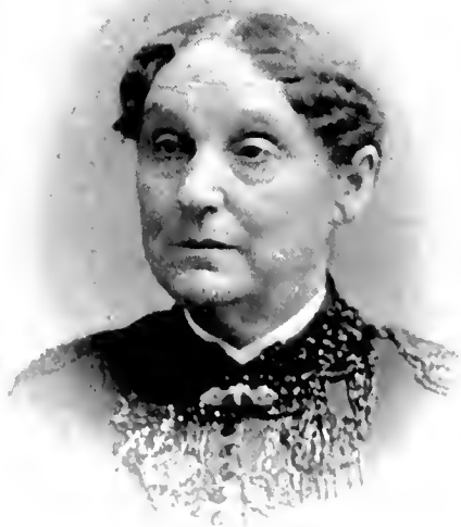
ABIGAIL SCOTT DUNIWAY.

leaving her no alternative. Nobly has she fulfilled the double trust of wife and mother. While Mrs. Duniway has been engaged in every sort of reputable literary toil, her life-work has been in the